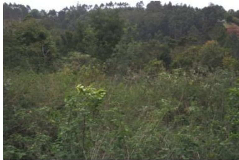
Photo 13: A view across the alien infested site at the gum plantation across the stream