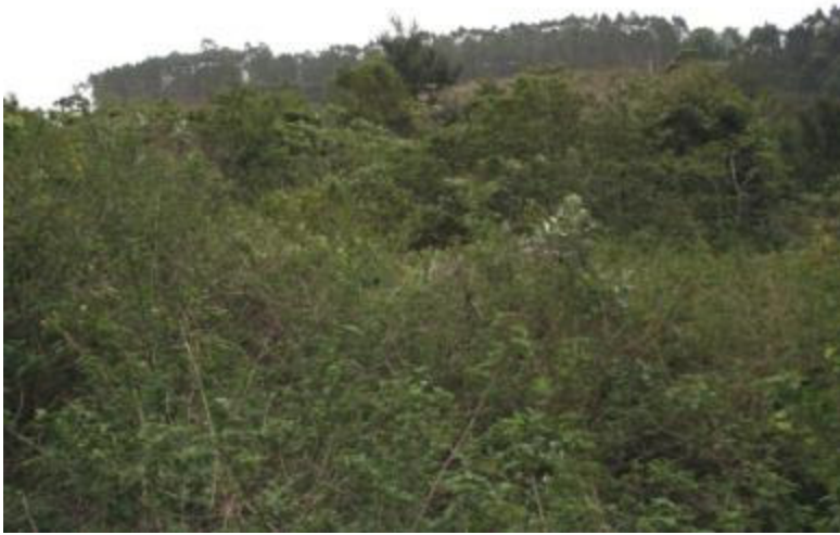
Photo 14: A view north-westward from the verge of the dense alien infestation