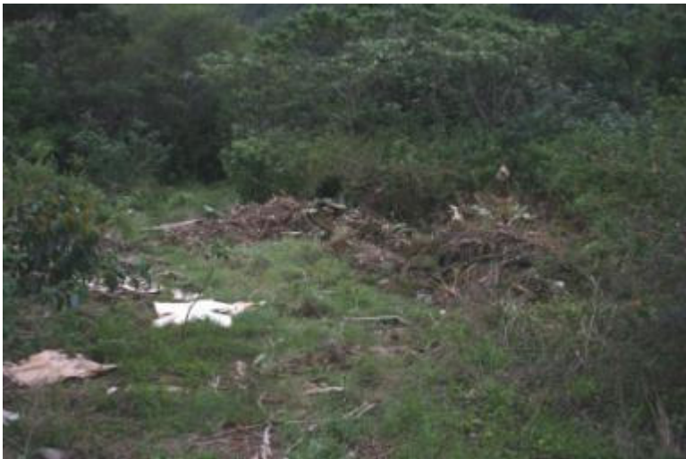
Photo 3: Garden refuse from surrounding households dumped on the site