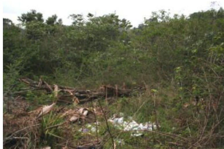
Photo 4: Garden refuse from surrounding households dumped on the site