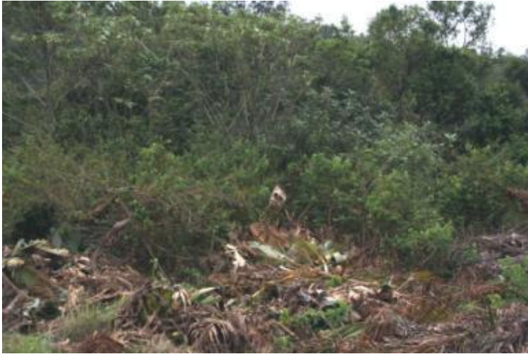
Photo 6: Garden refuse from surrounding households dumped on the site