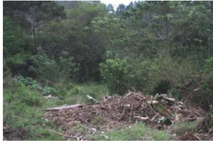
Photo 7: Garden refuse from surrounding households dumped on the site