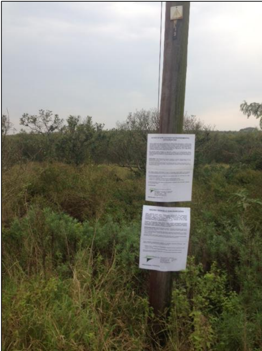
English and Zulu site notices at the start of the site.